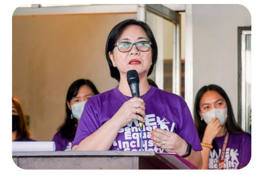
University Activities for Women's Month

Furthermore, the sub-theme, "DigitALL: Innovation and Technology for Gender Equality," calls for women's and their benefits from innovation and technology and bridging the gender gap in ICT and connectivity.